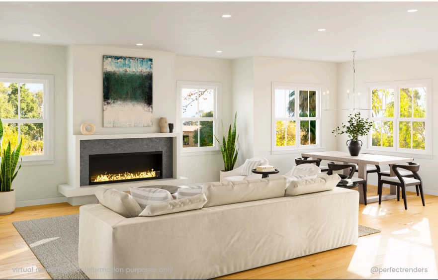
virtual renderings for information purposes only