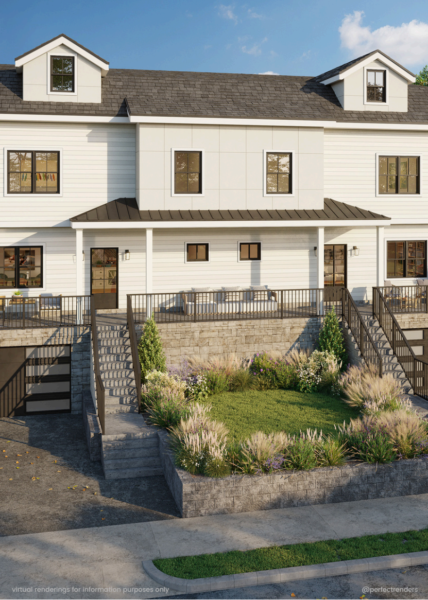
virtual renderings for information purposes only