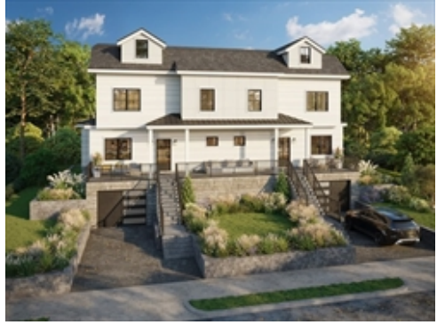
Exterior - Front