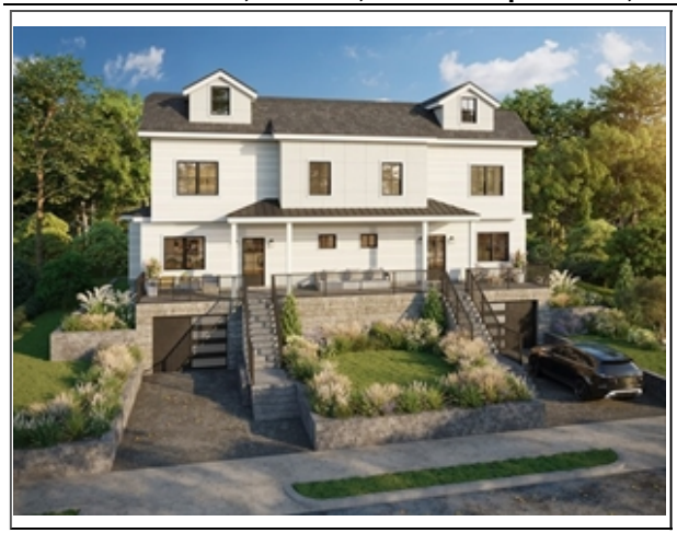
Exterior - Front